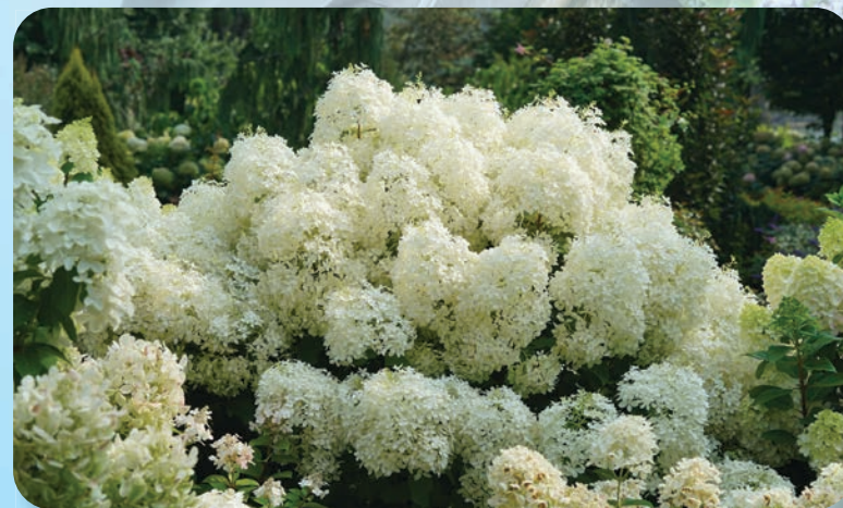
Proven Winners® Puffer Fish® Hydrangea Hydrangea paniculata hybrid

We aren't happy if you aren't happy. If you have any questions regarding your order please call us at 1-765-525-4065 during the hours of 8:30 am and 4:30 pm EST.