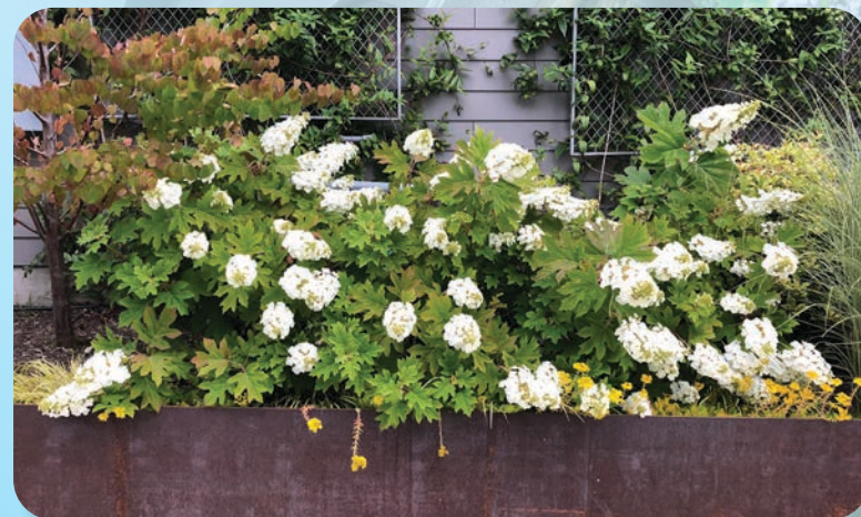
Ruby Slippers Oak Leaf Hydrangea Hydrangea quercifolia

We aren't happy if you aren't happy. If you have any questions regarding your order please call us at 1-765-525-4065 during the hours of 8:30 am and 4:30 pm EST.