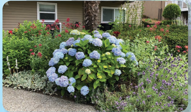
Onyx™ Mophead Hydrangea Hydrangea macrophylla hybrid

We aren't happy if you aren't happy. If you have any questions regarding your order please call us at 1-765-525-4065 during the hours of 8:30 am and 4:30 pm EST. You can email questions to us at: customerservice@robertasinc.com .