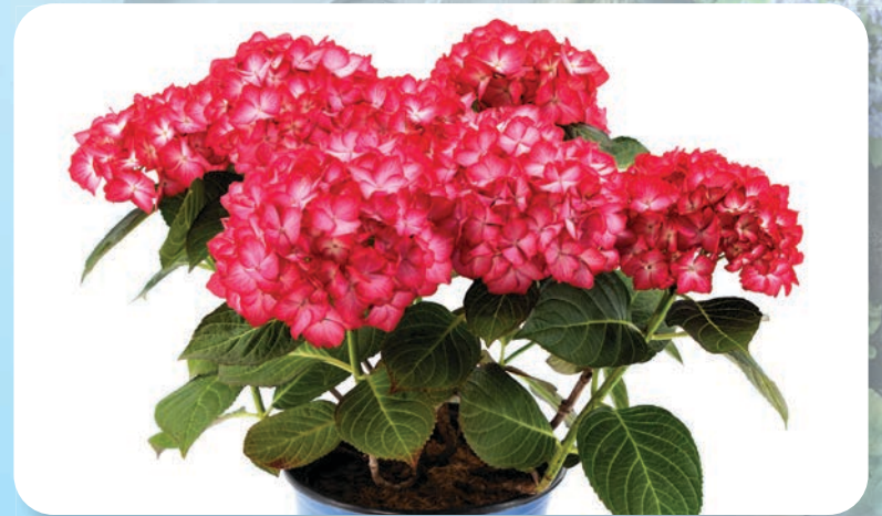
Bloomin' Easy® Kimono™ Hydrangea Hydrangea macrophylla hybrid

We aren't happy if you aren't happy. If you have any questions regarding your order please call us at 1-765-525-4065 during the hours of 8:30 am and 4:30 pm EST. You can email questions to us at: customerservice@robertasinc.com .