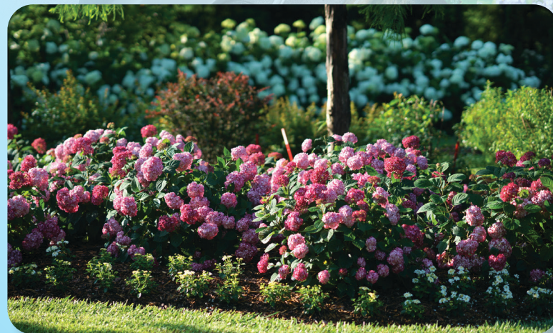
Proven Winners® Invincibelle® Ruby Smooth Hydrangea Hydrangea arborescens

We aren't happy if you aren't happy. If you have any questions regarding your order please call us at 1-765-525-4065 during the hours of 8:30 am and 4:30 pm EST. You can email questions to us at: customerservice@robertasinc.com .