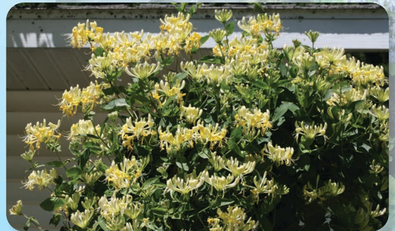
Proven Winners® 'Scentsation' Honeysuckle Lonicera periclymenum

We aren't happy if you aren't happy. If you have any questions regarding your order please call us at 1-765-525-4065 during the hours of 8:30 am and 4:30 pm EST. You can email questions to us at: customerservice@robertasinc.com .