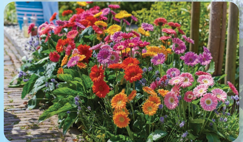
Sweet Series Hardy Gerber Daisies: Smile, Love, Sunset Gerbera hybrids

We aren't happy if you aren't happy. If you have any questions regarding your order please call us at 1-765-525-4065 during the hours of 8:30 am and 4:30 pm EST. You can email questions to us at: customerservice@robertasinc.com .