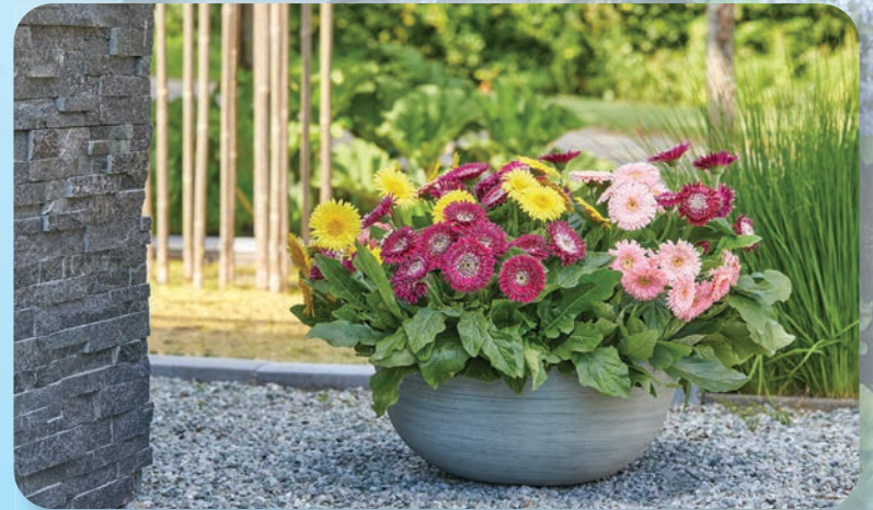
Majestic Gerber Daisies Gerbera hybrids

We aren't happy if you aren't happy. If you have any questions regarding your order please call us at 1-765-525-4065 during the hours of 8:30 am and 4:30 pm EST. You can email questions to us at: customerservice@robertasinc.com .