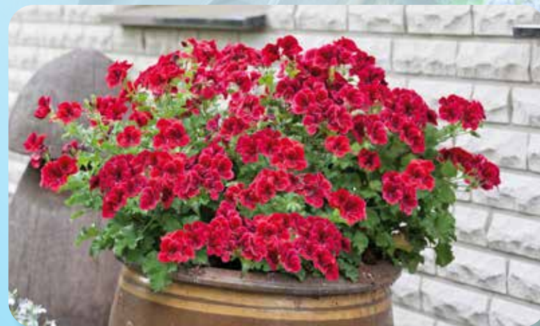
3pc Candy Flowers® Geraniums Pelargonium hybrids 'Candy Flowers'

We aren't happy if you aren't happy. If you have any questions regarding your order please call us at 1-765-525-4065 during the hours of 8:30 am and 4:30 pm EST.