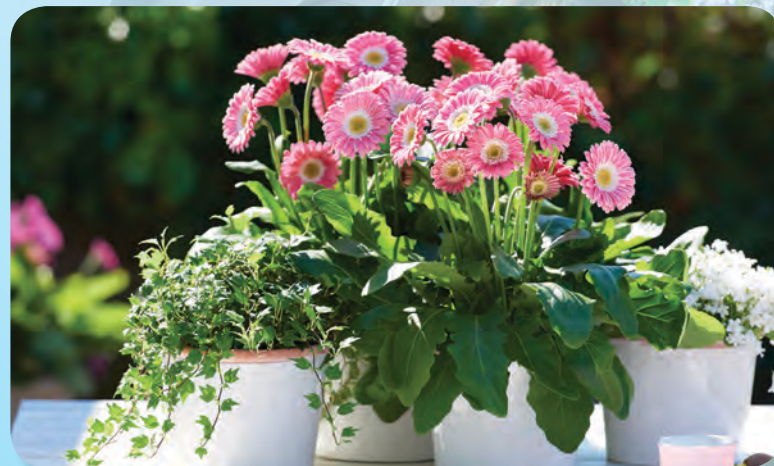
Garvinea® Hardy Gerber Daisies Gerbera hybrids

We aren't happy if you aren't happy. If you have any questions regarding your order please call us at 1-800-428-9726 during the hours of 8:30 am and 4:30 pm EST. You can email questions to us at: plantquestions@robertasinc.com .