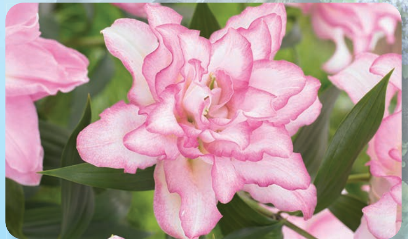
Roselily Lilium orientalis hybrids

We aren't happy if you aren't happy. If you have any questions regarding your order please call us at 1-765-525-4065 during the hours of 8:30 am and 4:30 pm EST. You can email questions to us at: customerservice@robertasinc.com .