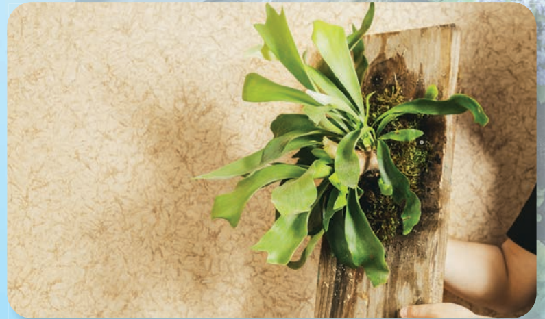
Staghorn Fern Mounted on Cedar 1pc Platycerium bifurcatum

We aren't happy if you aren't happy. If you have any questions regarding your order please call us at 1-765-525-4065 during the hours of 8:30 am and 4:30 pm EST.