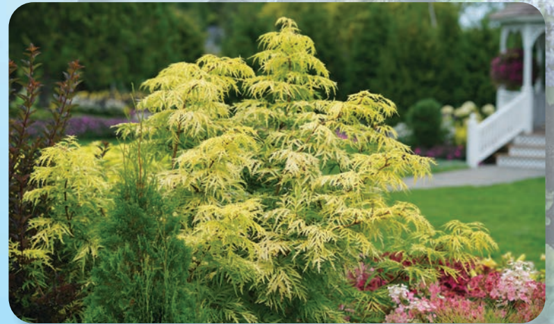
Proven Winners® Lemony Lace® Elderberry Sambucus racemosa

We aren't happy if you aren't happy. If you have any questions regarding your order please call us at 1-765-525-4065 during the hours of 8:30 am and 4:30 pm EST. You can email questions to us at: customerservice@robertasinc.com .