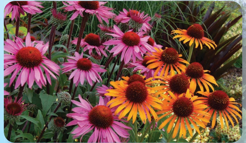
Sunmagic® Vintage Echinacea Echinacea hybrids 'Sunmagic'

We aren't happy if you aren't happy. If you have any questions regarding your order please call us at 1-765-525-4065 during the hours of 8:30 am and 4:30 pm EST.