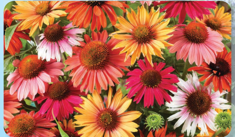
Sunseekers® Echinacea 3pc Echinacea hybrid

We aren't happy if you aren't happy. If you have any questions regarding your order please call us at 1-765-525-4065 during the hours of 8:30 am and 4:30 pm EST. You can email questions to us at: customerservice@robertasinc.com .