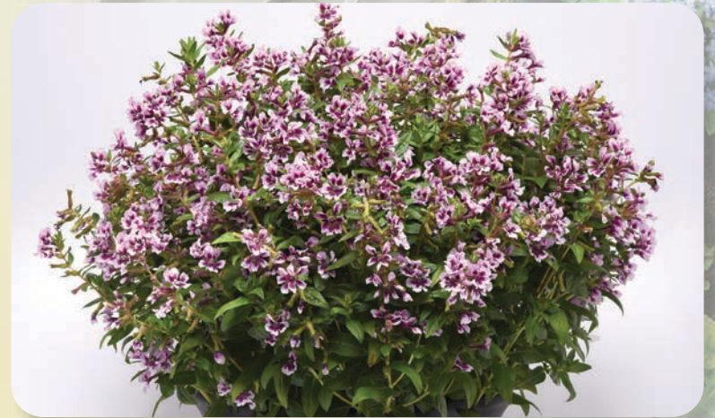
Cuphea Sweet Talk™ Cuphea procumbens