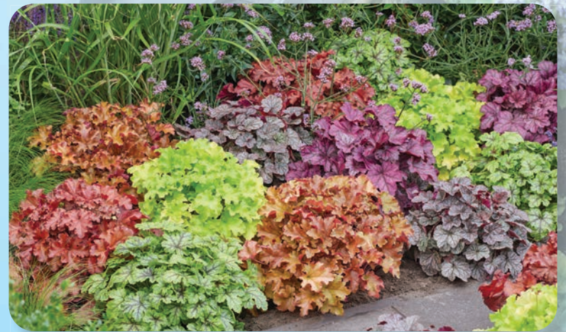
Summer Berry Coral Bells Heuchera hybrida

We aren't happy if you aren't happy. If you have any questions regarding your order please call us at 1-765-525-4065 during the hours of 8:30 am and 4:30 pm EST. You can email questions to us at: customerservice@robertasinc.com .