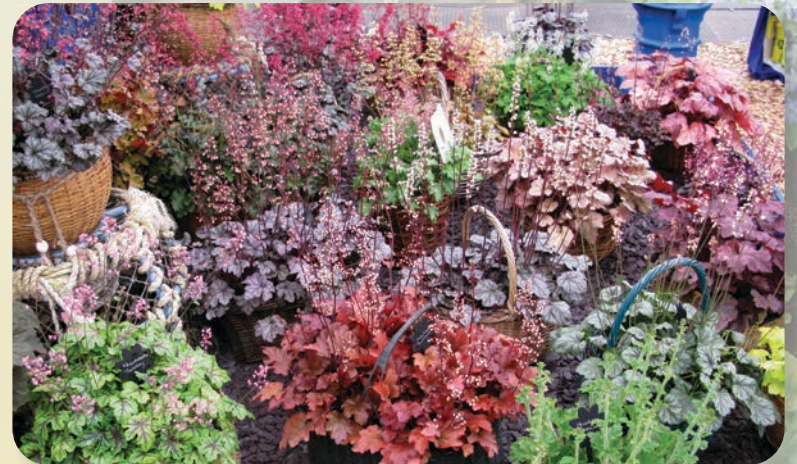
Coral Bells Heuchera hybrida