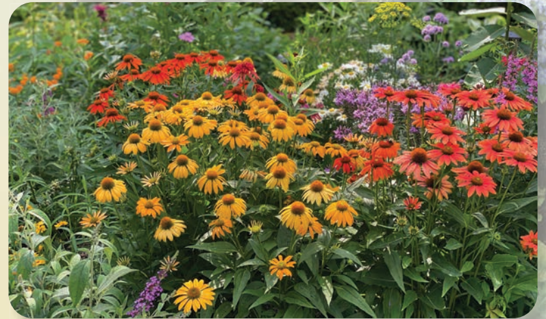
Echinacea Pollynation Golden Summer Mix Echinacea hybrid