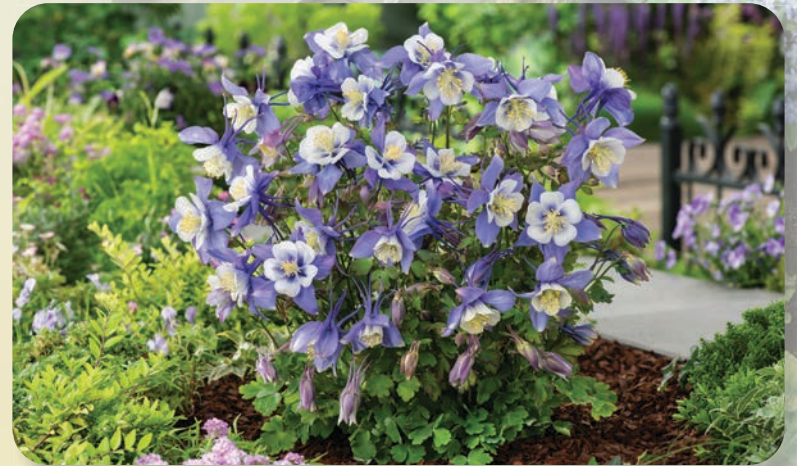
Earlybird™ Mix Columbines Aquilegia hybrids