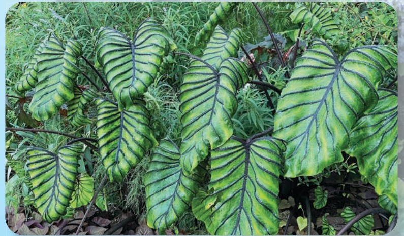
Elephant Ears Colocasia hybrids

We aren't happy if you aren't happy. If you have any questions regarding your order please call us at 1-765-525-4065 during the hours of 8:30 am and 4:30 pm EST.