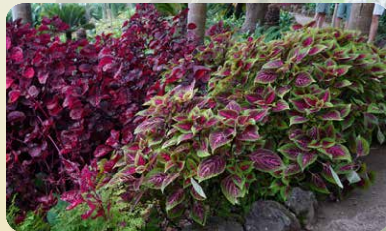
3pc Coleus Terrascape Collection Solenostemon x hybrid