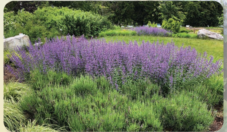
'Picture Purrfect' Catmint Nepeta hybrid