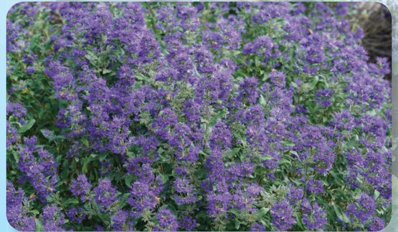
Beyond Midnight® Bluebeard Caryopteris x clandonensis

We aren't happy if you aren't happy. If you have any questions regarding your order please call us at 1-765-525-4065 during the hours of 8:30 am and 4:30 pm EST. You can email questions to us at: customerservice@robertasinc.com .