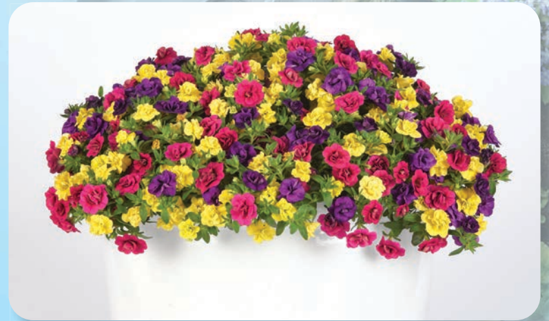
Trixi® Evo-Centric Calibrachoa Calibrachoa hybrids

We aren't happy if you aren't happy. If you have any questions regarding your order please call us at 1-765-525-4065 during the hours of 8:30 am and 4:30 pm EST.