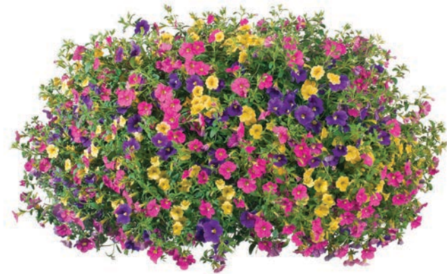
Lollipop Trixi® Calibrachoa Calibrachoa spp.

We aren't happy if you aren't happy. If you have any questions regarding your order please call us at 1-765-525-4065 during the hours of 8:30 am and 4:30 pm EST.