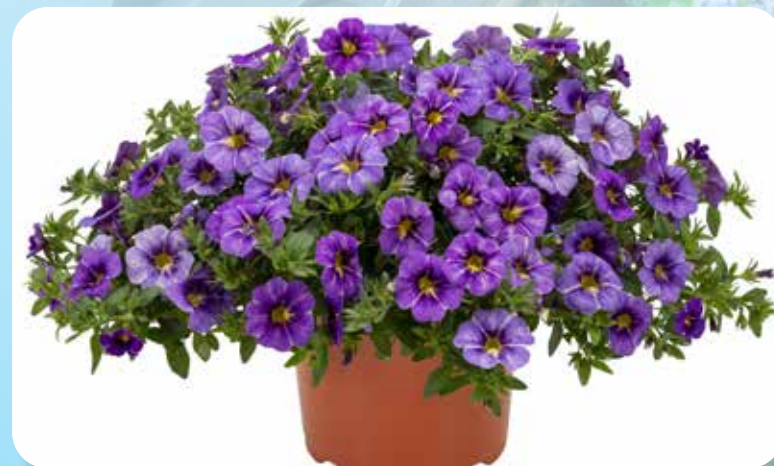
3pc Calibrachoa Rainbow® Calibrachoa hybrids

We aren't happy if you aren't happy. If you have any questions regarding your order please call us at 1-765-525-4065 during the hours of 8:30 am and 4:30 pm EST.