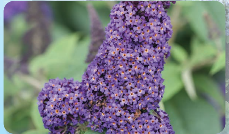
Proven Winners® Pugster® Blue Butterfly Bush Buddleia x

We aren't happy if you aren't happy. If you have any questions regarding your order please call us at 1-765-525-4065 during the hours of 8:30 am and 4:30 pm EST. You can email questions to us at: customerservice@robertasinc.com .