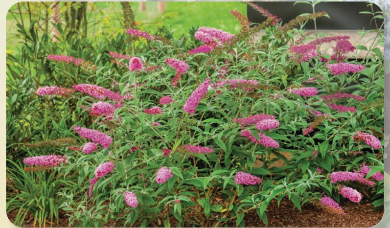
'Princess Pink' Butterfly Bush Buddleia hybrid 'Princess Pink'