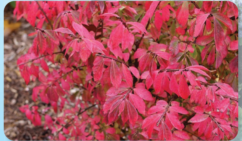
Proven Winners® Fire Ball® Burning Bush Euonymus alatus

We aren't happy if you aren't happy. If you have any questions regarding your order please call us at 1-765-525-4065 during the hours of 8:30 am and 4:30 pm EST. You can email questions to us at: customerservice@robertasinc.com .