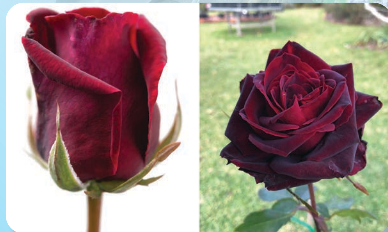
Brindabella Roses™ Rosa hybrids

We aren't happy if you aren't happy. If you have any questions regarding your order please call us at 1-765-525-4065 during the hours of 8:30 am and 4:30 pm EST. You can email questions to us at: customerservice@robertasinc.com .