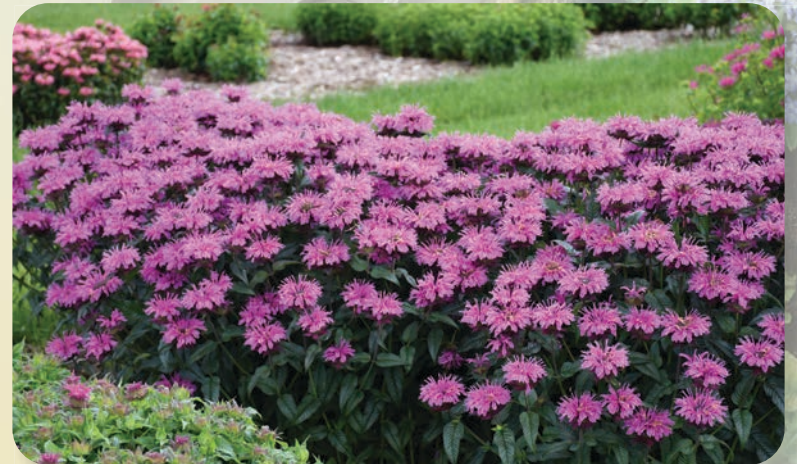
Sugar Buzz® Dwarf Beebalm Collection Monarda didyma hybrids