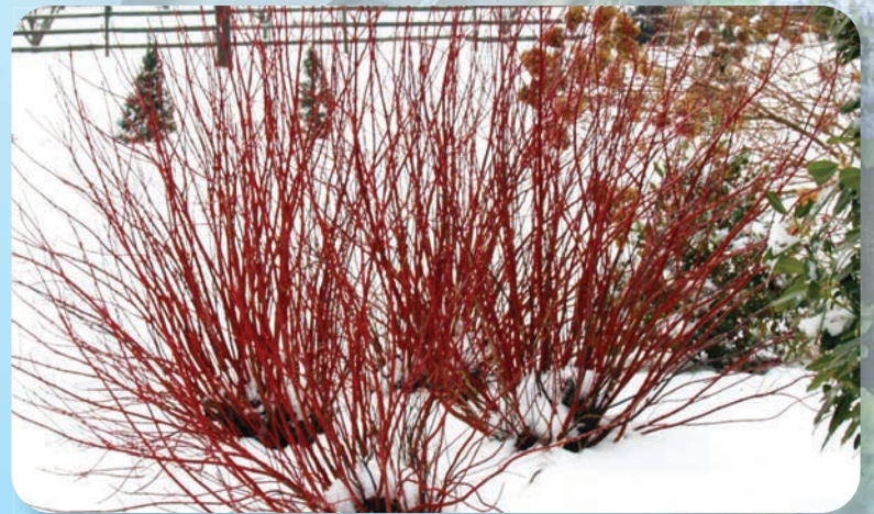
Arctic Fire® Red Dogwood Cornus stolonifera

We aren't happy if you aren't happy. If you have any questions regarding your order please call us at 1-765-525-4065 during the hours of 8:30 am and 4:30 pm EST. You can email questions to us at: customerservice@robertasinc.com .