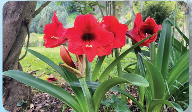
Amaryllis Hippeastrum hybrids

We aren't happy if you aren't happy. If you have any questions regarding your order please call us at 1-765-525-4065 during the hours of 8:30 am and 4:30 pm EST.