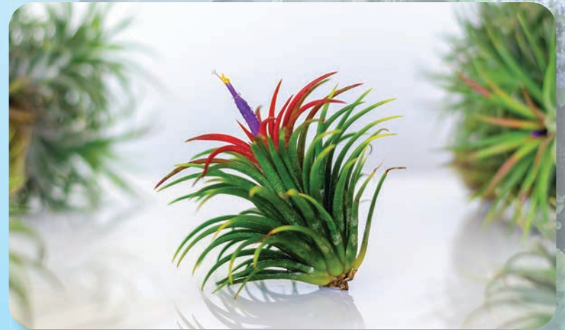
Air Plant Collection Tillandsia spp.

We aren't happy if you aren't happy. If you have any questions regarding your order please call us at 1-765-525-4065 during the hours of 8:30 am and 4:30 pm EST.