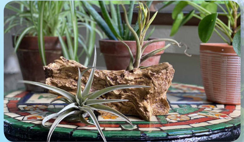
Air Plant Collection with Faux Log Container Tillandsia spp.

We aren't happy if you aren't happy. If you have any questions regarding your order please call us at 1-800-428-9726 during the hours of 8:30 am and 4:30 pm EST.