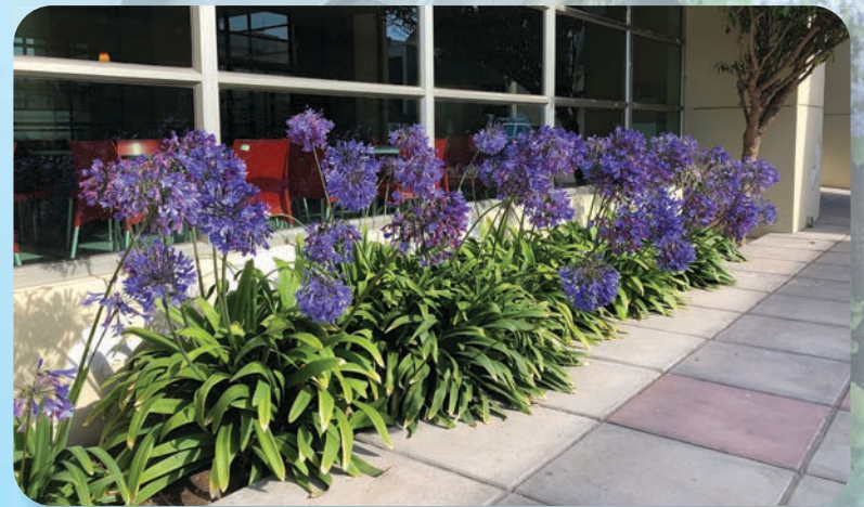
Hardy 'Johanna' Agapanthus Agapanthus x 'Johanna'

We aren't happy if you aren't happy. If you have any questions regarding your order please call us at 1-765-525-4065 during the hours of 8:30 am and 4:30 pm EST. You can email questions to us at: customerservice@robertasinc.com .